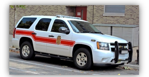
$44,310 Loss of Use