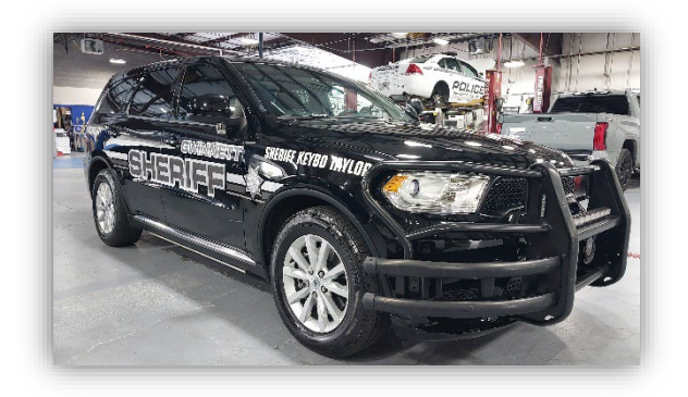
$75,832 in Loss of Use